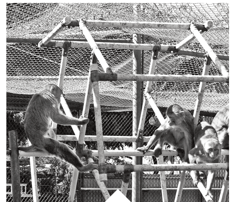
NONHUMAN PRIMATES USED IN MEDICAL RESEARCH

Monkeys are often involved at the later stage of the process—what is called translational or applied research. Here all of the knowledge accumulated earlier is applied to specific medical questions such as: Will this vaccine protect a pregnant woman (and her baby) from Zika infection? And is the vaccine likely to be safe?